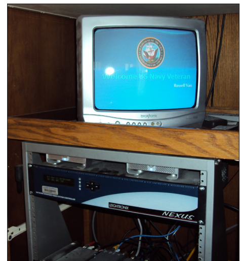
The home has used the NEXUS for two years now and recommends it to other facilities.

“I would definitely recommend this process because I wouldn’t be able to get this information out there if it