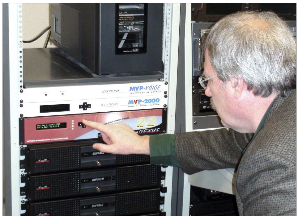
The UltraNEXUS scheduling software, WinLGX, has allowed Koeze to schedule shorter video programming in between meetings, creating the opportunity to keep citizens better informed.

The ease of adding short videos through digital programming has allowed the station to increase