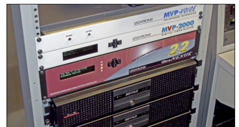
Koeze feels the UltraNEXUS is “a good mix between user friendly and technically geeky.”

On top of the server’s ability to decrease station errors, the cable television coordinator feels that the UltraNEXUS is a perfect fit for local broadcast stations because of its advanced features designed in a way that’s easy to use.