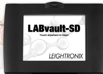
Multiple Control Options